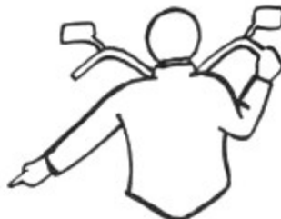
Hazards on the road