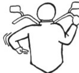
Time for a pit stop