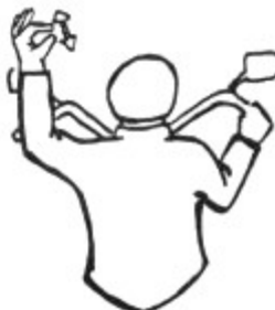
Turn off your turn signals