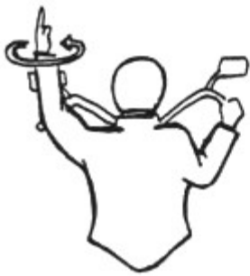
Start your engines