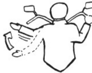
Go ahead and pass me