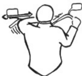
Stop your engines